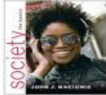
11 th edition