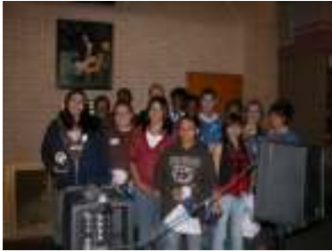
On February 23, 2008, the area Upward Bound programs participated in the First Annual Combined TRIO Day Celebration.

Midland, Odessa, and Western Texas College Upward Bound programs joined together to celebrate National TRIO Day on the Midland College campus. Participants from all three insti-