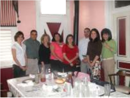
MC, OC, and WTC UB Programs

On February 28, 2007 Midland, Odessa, and Western Texas College Upward Bound personnel met at the Barn Door in Odessa, TX to become familiar with one another and exchange good