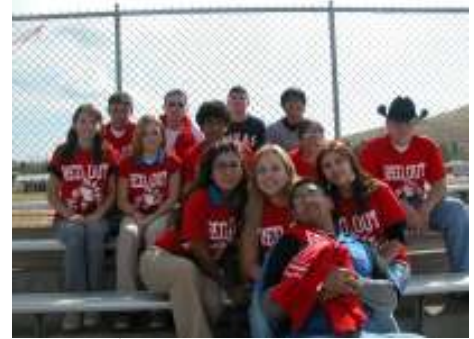
OC & Sul Ross UB Participants Enjoying the Game

summer. The Odessa College UB Staff and Students had a fun and informative time and look forward to future college visits.