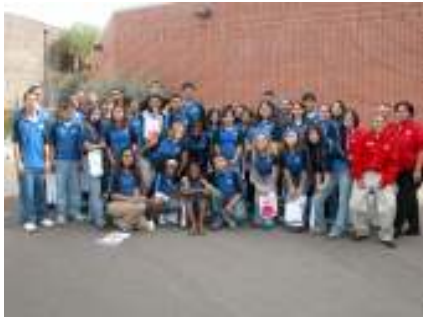
OC UB and Sul Ross Staff and Participants

The Odessa College Upward Bound Program visited Sul Ross State University in Alpine, Texas on November 4, 2006. UB Participants were given a campus tour by Sul Ross UB and Ambassador personnel