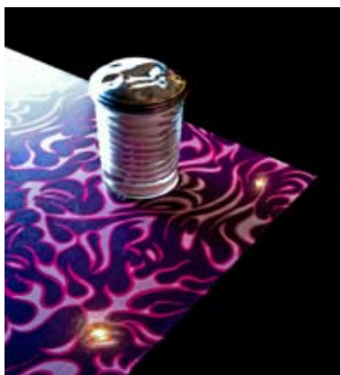
Cell Phone Photo Contest I